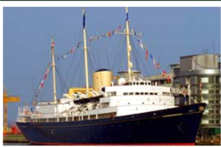
Royal Yacht Britannia, Leith, Near Edinburgh

September 6 to 20, 2020 15 Day Luxury Coach Tour